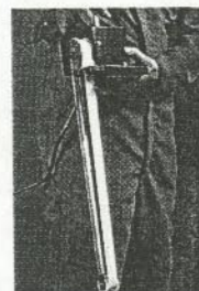
Mighty-Mini™ Skimmer is ideal for small tanks or drums.

For smaller tanks or drums, choose the compact Abanaki Mighty-Mini™ Skimmer. It fits into a 2" drum bung and skims up to one gallon of oil per hour. Stainless steel belt has wipers on both sides for more skimming capacity. Stainless steel belts available in 6", 12", 18" and 24" lengths.