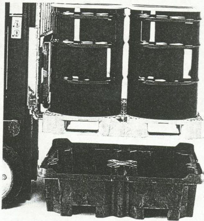
Pallet and sump (sold as a unit) separate for easy transportation and interlock for an exact fit.