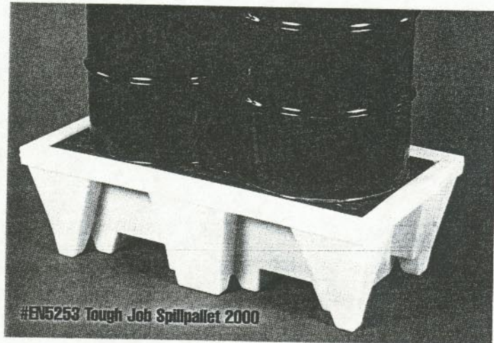
#EN5253 Tough Job Spillpallet 2000