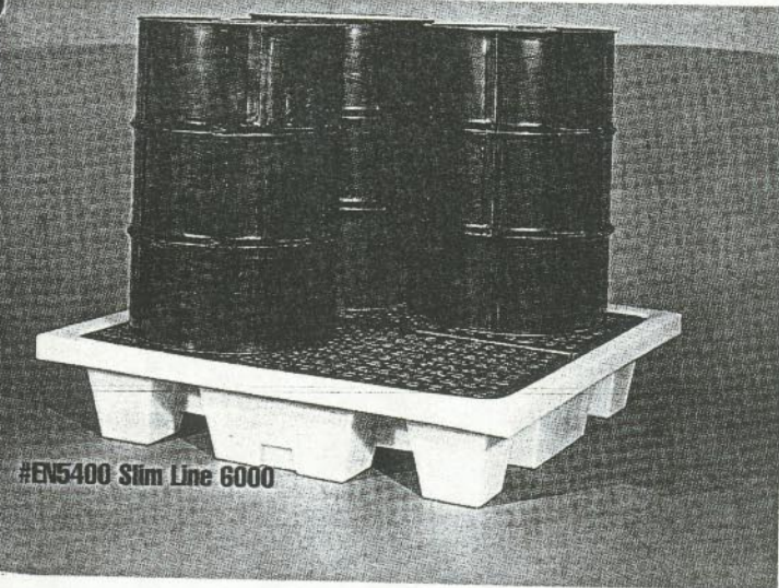
#EN5400 Slim Line 6000