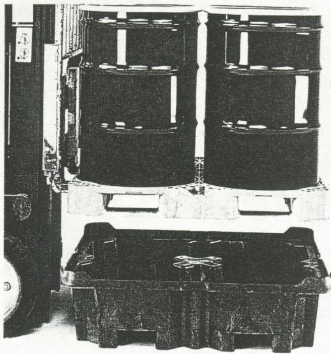
Pallet and sump (sold as a unit) separate for easy transportation and interlock for an exact fit.