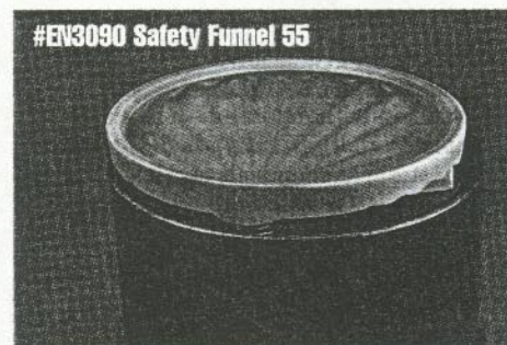
#EN3090 Safety Funnel 55