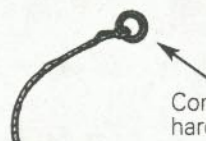
Connector hardware & line