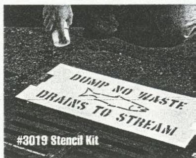
#3019 Stencil Kit