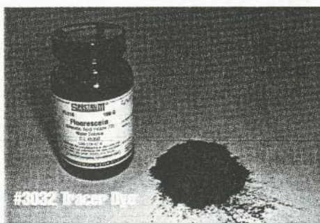
#3032 Tracer Dye

More and more municipalities are accepting our Passive Skimmer for use in catch basins in lieu of small oil/water separators for parking garages and small parking lots. This makes sense because it is much easier and more cost effective to periodically replace the Passive Skimmer than to pump out an entire oil/water separator.